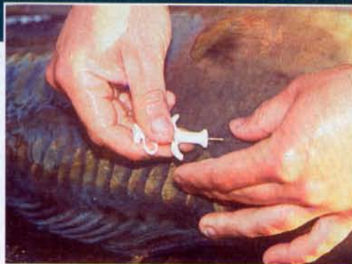
In goes the Tracer tag on a Bury Hill carp.