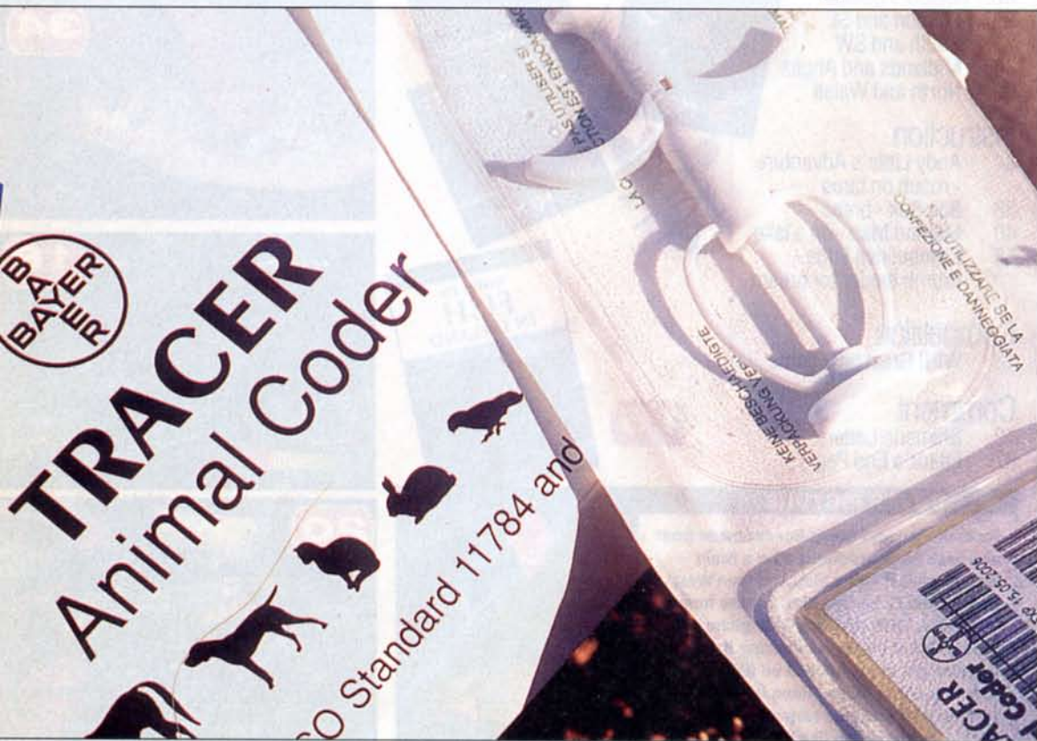
These hi-tech tags could be the way forward for precious fishery stocks