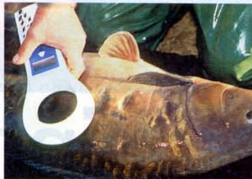
A quick scan confirms the fish's identity.